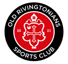
MOTIVATE INSPIRE RESPECT

privacy policy so we advise you review that policy together with this notice. If you would like your personal data to be deleted from Whole Game System then please contact them.